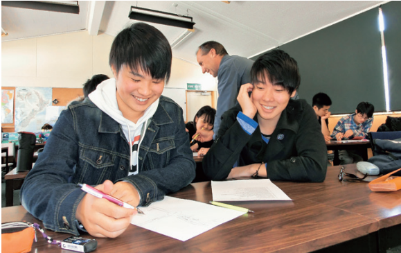
Classroom in New Zealand

In order for students to fully benefit from their academic year in New Zealand, we provide preparatory training in advance. This includes gaining a sufficient level of English for a smooth homestay experience and learning to respect and be compassionate to others. Students individually study the local geography, culture, and activities of their future campus area. This information is valuable for living a comfortable life there. They also prepare for the courses they will take.