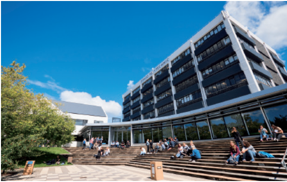
Otago Polytechnic in New Zealand